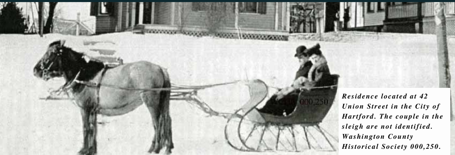
Residence located at 42 Union Street in the City of Hartford. The couple in the sleigh are not identified.

Throughout this issue, you will learn about other innovations and examples of your county government’s entrepreneurial spirit. I’m proud of all we have accomplished and together we will continue to seek ways to enhance “Our Great Community” in 2022 and beyond!